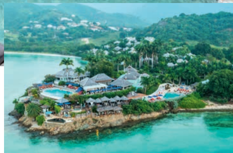
Left and above: Sheer Rocks has two pools available for exclusive bookings. Below: the inventor of the BVI's Painkiller

Taking its name from the cliff top on which it perches, Sheer Rocks offers unbeatable views from its infinity pool on the south-west coast of Antigua, and the cocktails are pretty unforgettable too. With an à la carte menu that supports local farmers, fishers and artisanal food producers, the Mediterranean-inspired food here is market fresh. Regular events throughout the winter months include Music on the Rocks and cricket parties when the West Indies are in play. sheer-rocks.com