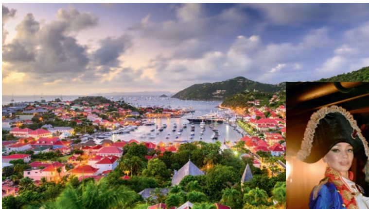
Le Ti provides costumes for diners to get dressed up in