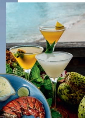
Dance, drink and dine at Basil's Bar, which has hosted locals and visitors for nearly 50 years