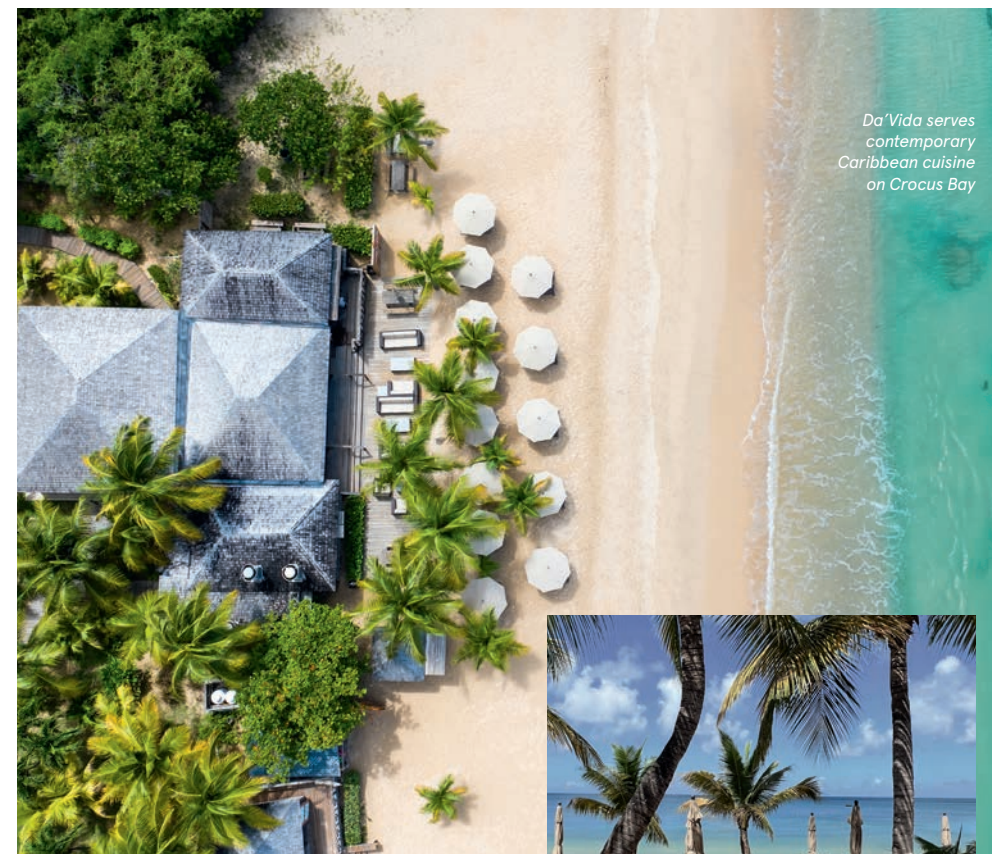
Da'Vida serves contemporary Caribbean cuisine on Crocus Bay