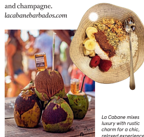
La Cabane mixes luxury with rustic charm for a chic, relaxed experience

Laid-back vibes are the name of the game at La Cabane, located on the island's tranquil west coast. It's right on the shoreline, making it a daytime and sunset favourite for locals and visitors alike. The "slow" menu aims for sustainability and uses locally sourced ingredients for its dishes, and the drinks list includes a wealth of cocktails and a selection of French wines and champagne. lacabanebarbados.com