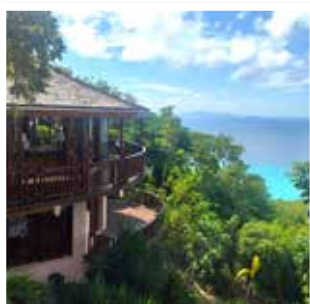
Top: Paraiba villa. Below: The splendour of Toucan Hills